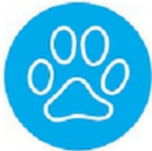
Animal Health Care