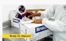
Ready for shipment