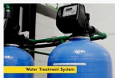
Water Treatment System