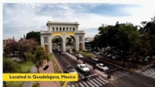
Located in Guadalajara, Mexico